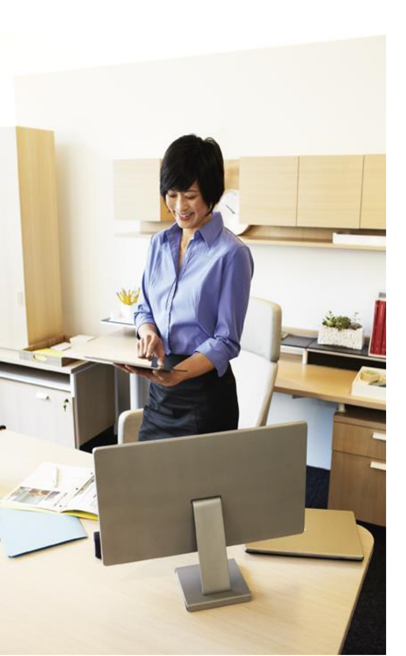
Table of contents Overview The value of the SPLA to your organization Eligibility & How the SPLA is structured 6 Requirements Licensing Models Licensing models available and licensing terms & Terms Participation 9 Participating in the SPLA Pricing & Determining product prices and reporting use 9 Reporting 12 Resources Additional resources to help you get full value from your SPLA 13 Glossary Commonly used terms related to the SPLA