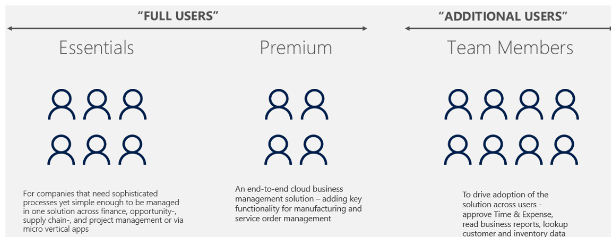
Figure 3: User Types

Additional users often represent a significant percentage of users in an organization and may consume data or reports from line of business systems, complete light tasks like time or expense entry and HR record updates or be heavier users of the system, but not require full user capabilities. These additional users are licensed with Dynamics 365 Business Central Team Members.