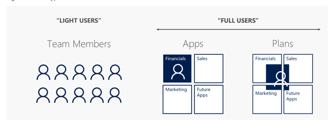
Figure 3: User Types