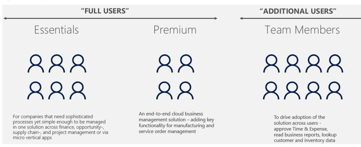
Figure 3: User Types

Additional users often represent a significant percentage of users in an organization and may consume data or reports from line of business systems, complete light tasks like time or expense entry and HR record updates or be heavier users of the system, but not require full user capabilities. These additional users are licensed with Dynamics 365 Business Central Team Members.