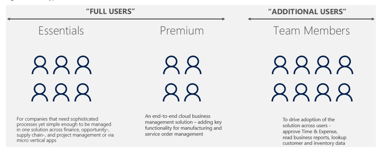
Figure 3: User Types

Additional users often represent a significant percentage of users in an organization and may consume data or reports from line of business systems, complete light tasks like time or expense entry and HR record updates or be heavier users of the system, but not require full user capabilities. These additional users are licensed with Dynamics 365 Business Central Team Members.